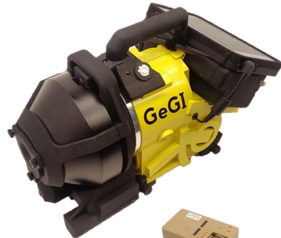
2590 300 W-hr External battery