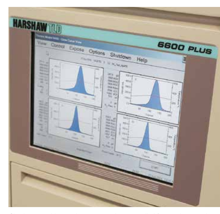
Simple, menu driven maintenance routines controlled from an integrated touch screen display save technicians time and increase reader uptime.

Equipped with two heating/data acquisition channels and dual cooled photo multiplier tubes, the Harshaw 6600 Plus can simultaneously read two TL elements, improving processing speeds and improving productivity. In addition, the Harshaw 6600 Plus operates automatically to process up to 200 TLD cards per processing run. With an optional internal irradiator, the Harshaw 6600 Plus can perform automated calibrations, reducing set-up time and further improving process efficiency.